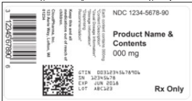
DSCSA RX Serialized Unit Label