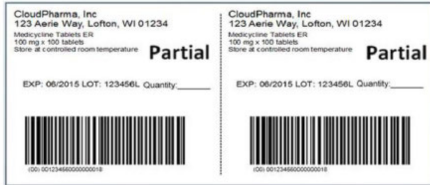
Example Partial Case Labeled with SSCC